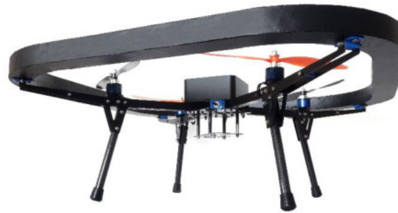
The QCS in the flying version (QCS-F)

The QCS contains an inertial measurement unit, an onboard micro controller, 4 motors and motor drivers (ESCs). Moreover the QCS includes the DOF – Suspensions together with a stable stand for the easy start in quadrotor programming at your desk.